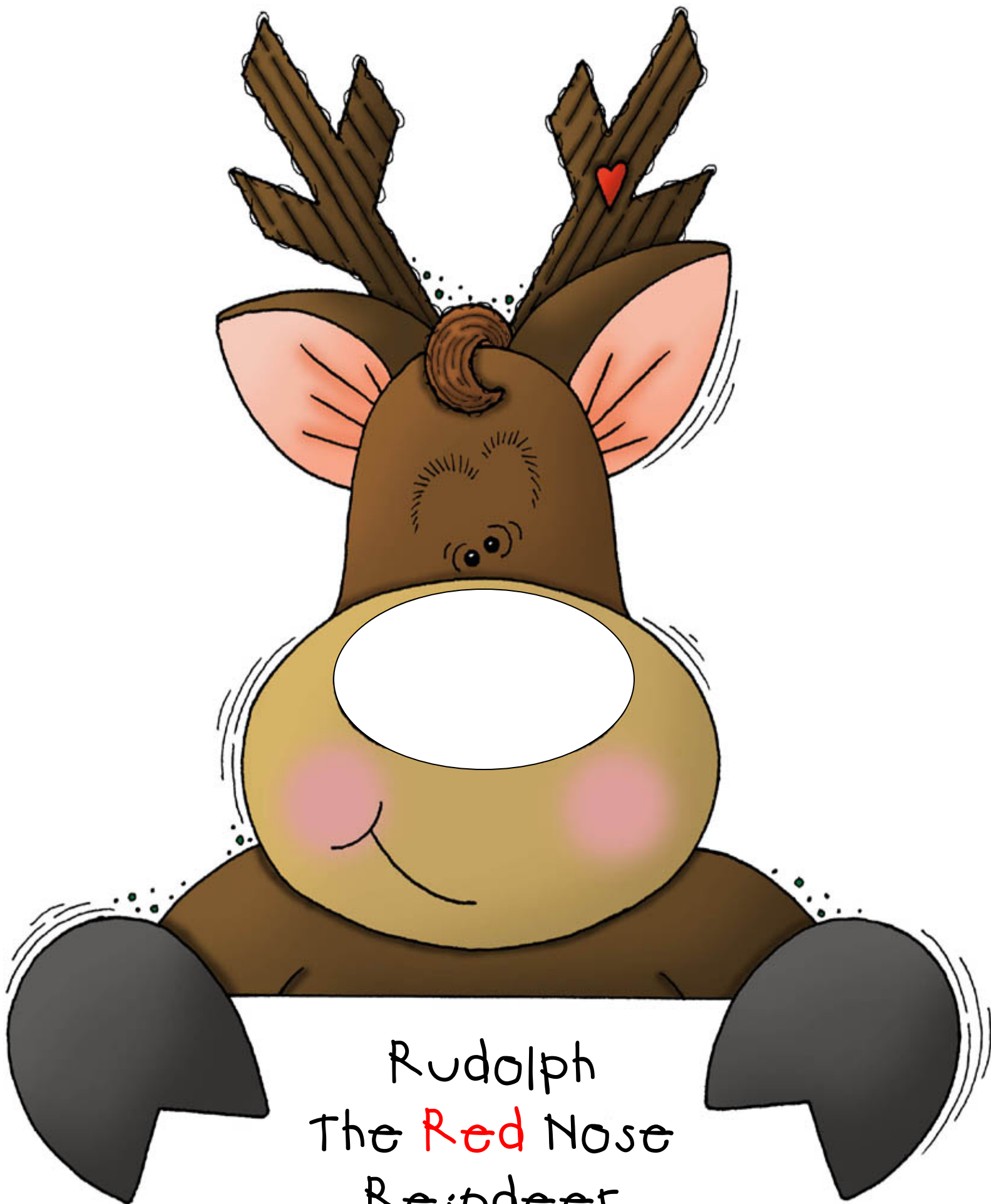
Rudolph The Red Nose Reindeer