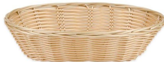
Basket To purchase from Amazon, click on picture.